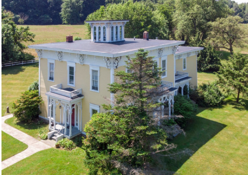
More than 120 acres surrounds the Battles Yellow House in Girard.