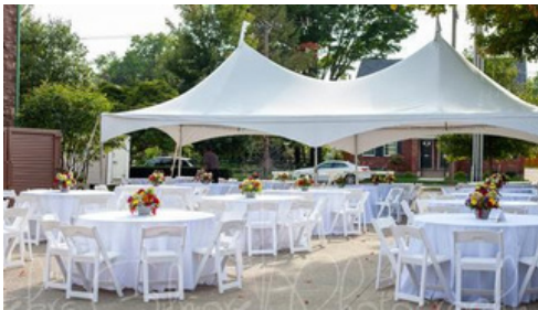
More than 500 guests have attended events at the Mansion with outdoor seating and tents.