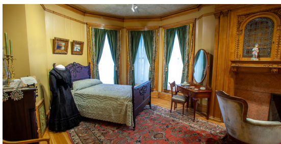
The Curtze Legacy Room is in the Watson-Curtze Mansion.