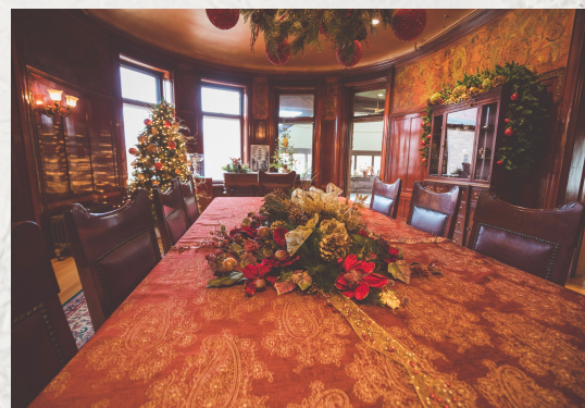
The mansion is decorated for the holidays with a tree in nearly every room.