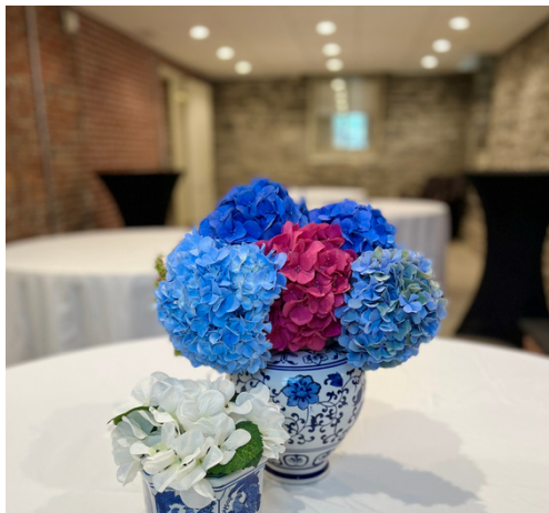
The President's Room is our newest venue.