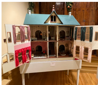
This 1890s dollhouse is among the dollhouses on exhibit on the second floor of the Watson-Curtze Mansion.

A hunting and fishing exhibit will open Dec. 1, and features outerwear, artifacts, antique duck decoys and many valuable objects that members of the community have donated and/or loaned to the History Center.