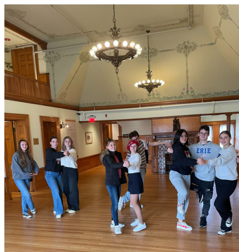
French exchange students from Fairview High School enjoyed a free tour of the campus and danced in the mansion ballroom.

Please help us continue our mission to collect, preserve and share our region's history. Thank you for your consideration. You can make your donation by going online to www.eriehistory.org/donate .