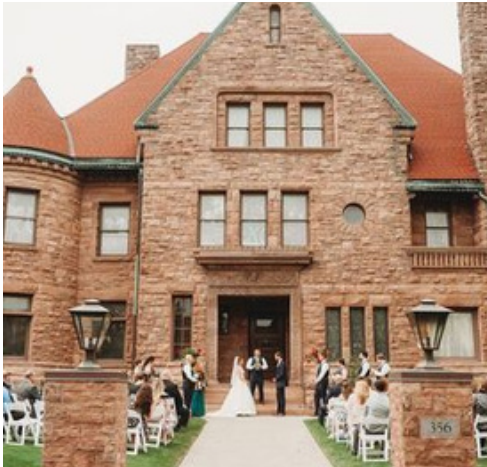
We have the perfect place to say, "I do."