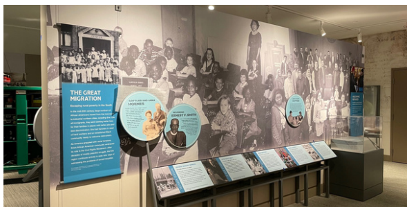
The Story of Us exhibit has been popular among Erie residents past and present.