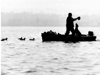
Antique duck decoys will be among the artifacts on exhibit in the Watson-Curtze Mansion.

This is a must-see exhibit that will be on display for one year.